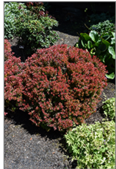
Golden Ruby Barberry