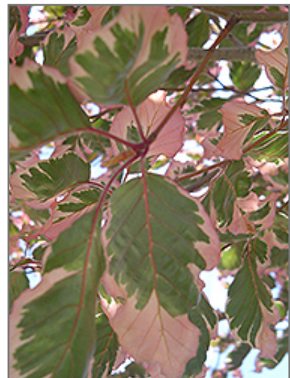
Tricolor Beech foliage