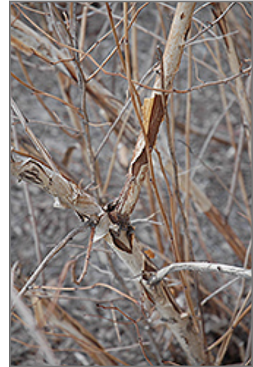
Diablo Ninebark bark

This shrub does best in full sun to partial shade. It is very adaptable to both dry and moist locations, and should do just fine under average home landscape conditions. It is not particular as to soil type or pH. It is highly tolerant of urban pollution and will even thrive in inner city environments. This is a selection of a native North American species.