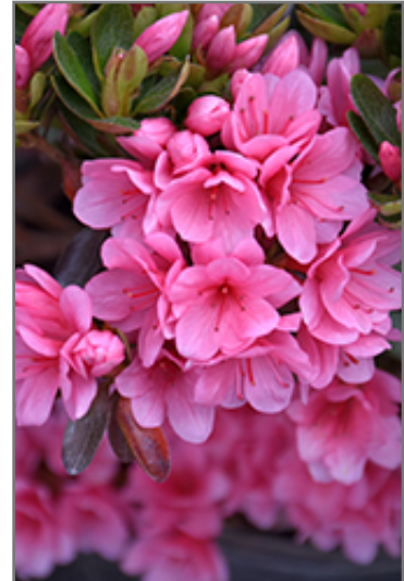
Coral Bells Azalea flowers