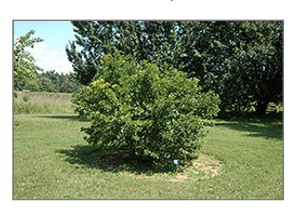
Jade Butterflies Ginkgo

Jade Butterflies Ginkgo is recommended for the following landscape applications;