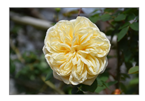
Teasing Georgia Rose flowers

This elegant shrub produces full, yellow-peach blooms; outer petals fall back and mature to butter yellow; lovely strong fragrance; needs full sun and well-drained soil; good disease resistance; can be trained as a climbing rose