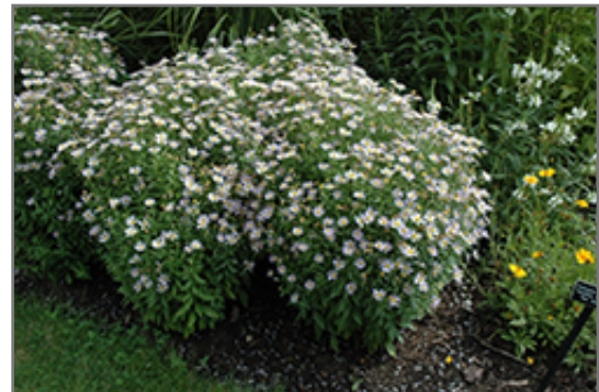
Blue Star Japanese Aster in bloom