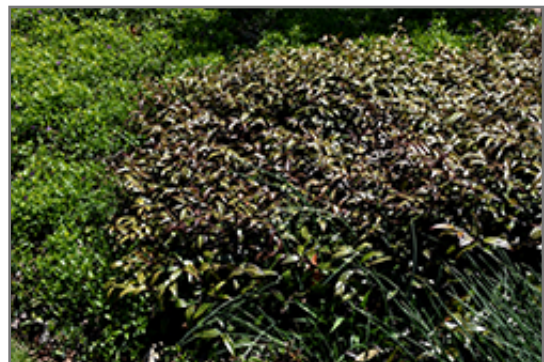
Scarletta Fetterbush