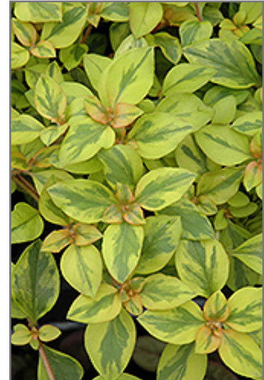
Walkabout Sunset Loosestrife foliage

Walkabout Sunset Loosestrife is recommended for the following landscape applications;