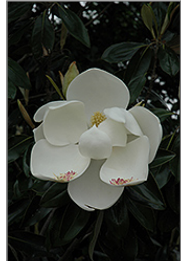
Teddy Bear Magnolia flowers