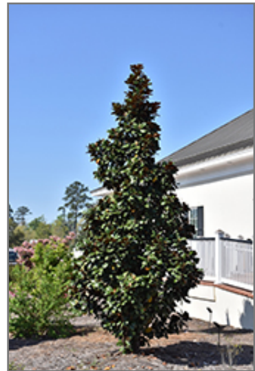
Teddy Bear Magnolia