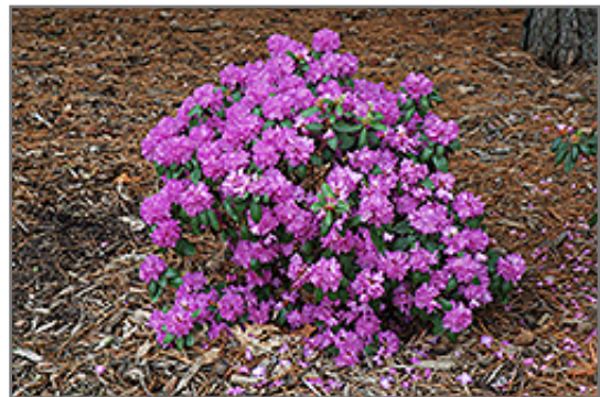
Compact P.J.M. Rhododendron in bloom