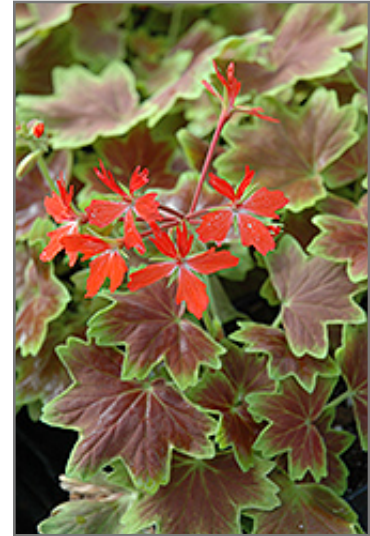
Vancouver Centennial Geranium flowers