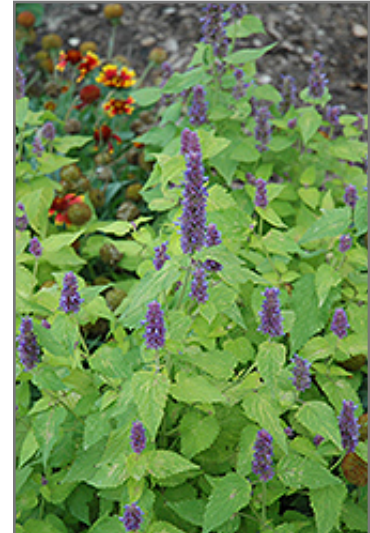
Golden Jubilee Anise Hyssop flowers

Golden Jubilee Anise Hyssop is a dense herbaceous perennial with an upright spreading habit of growth. Its medium texture blends into the garden, but can always be balanced by a couple of finer or coarser plants for an effective composition.