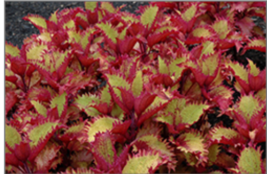
Henna Coleus foliage