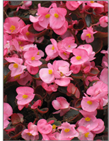
Bada Boom Pink Begonia flowers

This is a high maintenance plant that will require regular care and upkeep, and usually looks its best without pruning, although it will tolerate pruning. Deer don't particularly care for this plant and will usually leave it alone in favor of tastier treats. Gardeners should be aware of the following characteristic(s) that may warrant special consideration;