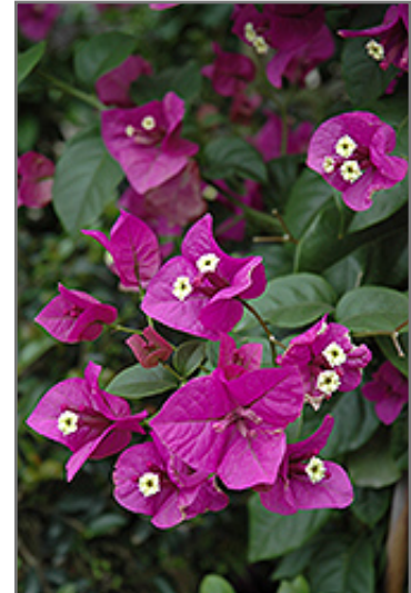
Purple Queen Bougainvillea flowers