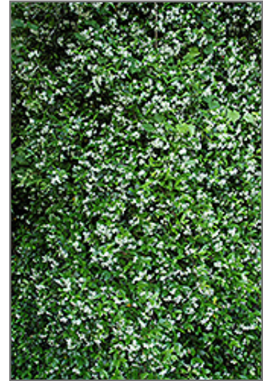
Confederate Star-Jasmine flowers

Confederate Star-Jasmine makes a fine choice for the outdoor landscape, but it is also well-suited for use in outdoor pots and containers. Because of its spreading habit of growth, it is ideally suited for use as a 'spiller' in the 'spiller-thriller-filler' container combination; plant it near the edges where it can spill gracefully over the pot. It is even sizeable enough that it can be grown alone in a suitable container. Note that when grown in a container, it may not perform exactly as indicated on the tag - this is to be expected. Also note that when growing plants in outdoor containers and baskets, they may require more frequent waterings than they would in the yard or garden.