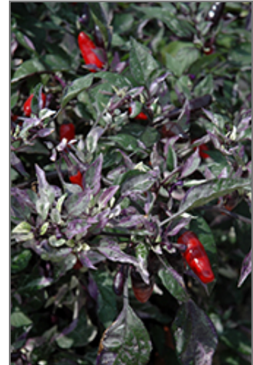
Calico Ornamental Pepper fruit