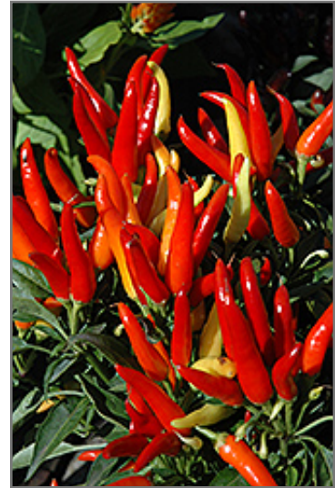
Chilly Chili Ornamental Pepper fruit

Chilly Chili Ornamental Pepper is an herbaceous annual with an upright spreading habit of growth. Its medium texture blends into the garden, but can always be balanced by a couple of finer or coarser plants for an effective composition.