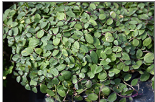
County Park Star Creeper foliage