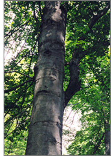
American Beech bark

This tree should only be grown in full sunlight. It requires an evenly moist well-drained soil for optimal growth, but will die in standing water. It is not particular as to soil pH, but grows best in rich soils. It is quite intolerant of urban pollution, therefore inner city or urban streetside plantings are best avoided, and will benefit from being planted in a relatively sheltered location. This species is native to parts of North America.