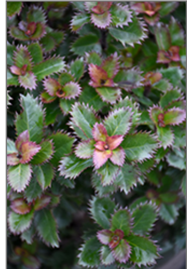
Scallywag Holly foliage