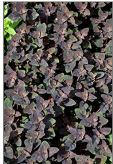
Persian Chocolate Loosestrife foliage