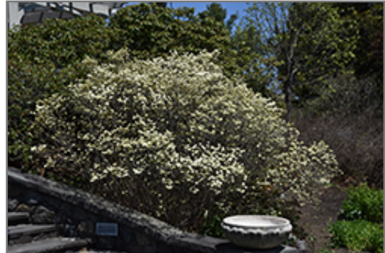
Dwarf Fothergilla in bloom