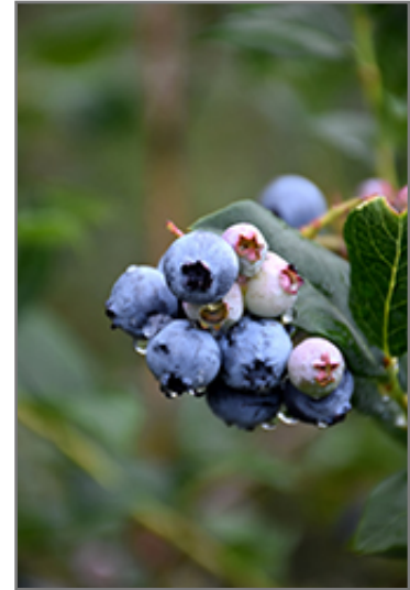
Chippewa Blueberry fruit

Chippewa Blueberry features dainty clusters of white bell-shaped flowers with shell pink overtones hanging below the branches in mid spring. It has green deciduous foliage. The glossy oval leaves turn an outstanding orange in the fall. It features an abundance of magnificent blue berries in mid summer.