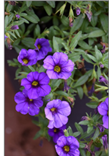
Aloha Kona Midnight Blue Calibrachoa flowers

This plant will require occasional maintenance and upkeep. Trim off the flower heads after they fade and die to encourage more blooms late into the season. It is a good choice for attracting bees and hummingbirds to your yard, but is not particularly attractive to deer who tend to leave it alone in favor of tastier treats. It has no significant negative characteristics.