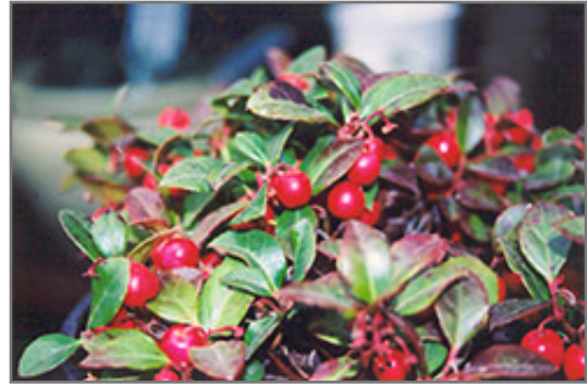
Creeping Wintergreen fruit