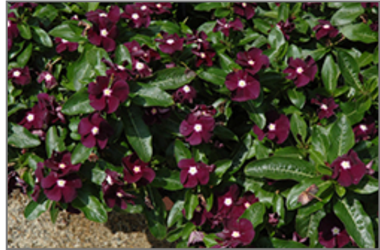
Jams 'N Jellies Blackberry Vinca flowers

Jams 'N Jellies Blackberry Vinca is recommended for the following landscape applications;