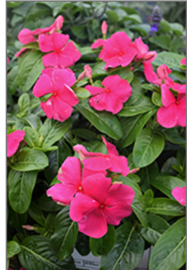
Titan Punch Vinca flowers

This plant will require occasional maintenance and upkeep, and should not require much pruning, except when necessary, such as to remove dieback. It is a good choice for attracting butterflies to your yard, but is not particularly attractive to deer who tend to leave it alone in favor of tastier treats. It has no significant negative characteristics.