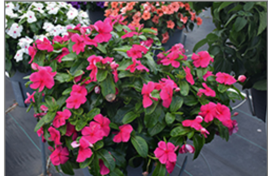
Titan Punch Vinca in bloom

Titan Punch Vinca is a fine choice for the garden, but it is also a good selection for planting in outdoor containers and hanging baskets. It is often used as a 'filler' in the 'spiller-thriller-filler' container combination, providing a mass of flowers against which the thriller plants stand out. Note that when growing plants in outdoor containers and baskets, they may require more frequent waterings than they would in the yard or garden.