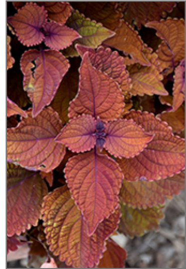
Wall Street Coleus foliage