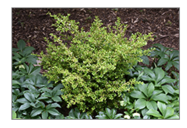
Golden Dream Boxwood

Golden Dream Boxwood is a dense multi-stemmed evergreen shrub with a mounded form. It lends an extremely fine and delicate texture to the landscape composition which should be used to full effect.