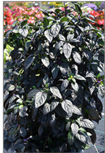
Black Pearl Ornamental Pepper