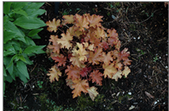
Zipper Coral Bells