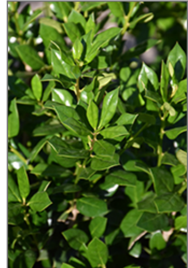
Needlepoint Chinese Holly foliage

Needlepoint Chinese Holly is recommended for the following landscape applications;