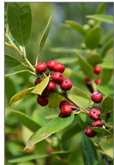
Needlepoint Chinese Holly fruit