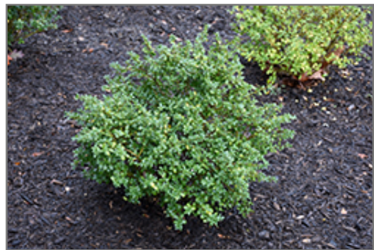
Green Lustre Japanese Holly