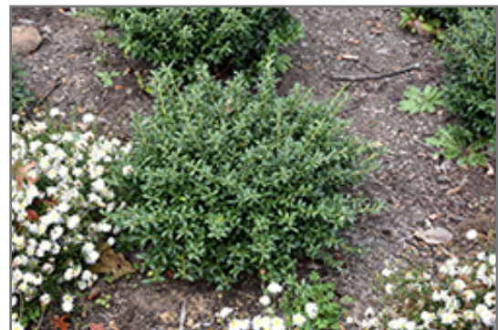
Soft Touch Japanese Holly