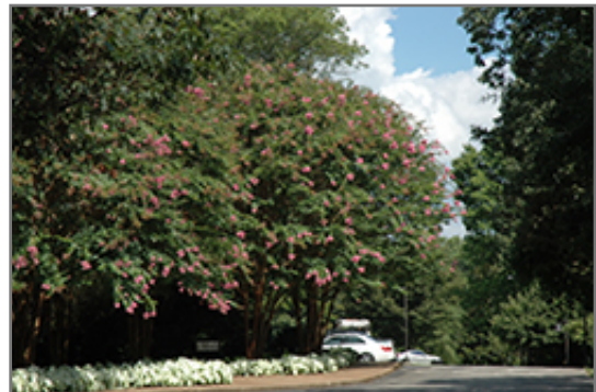
Miami Crapemyrtle in bloom