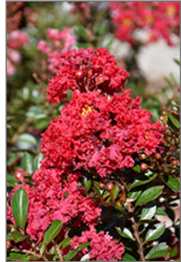
Cherry Dazzle Crapemyrtle flowers

This shrub will require occasional maintenance and upkeep. Trim off the flower heads after they fade and die to encourage more blooms late into the season. It has no significant negative characteristics.