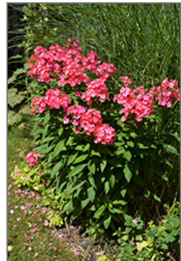
Flame Coral Garden Phlox in bloom