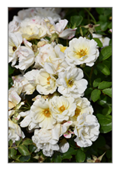
White Drift Rose flowers

White Drift Rose is recommended for the following landscape applications;