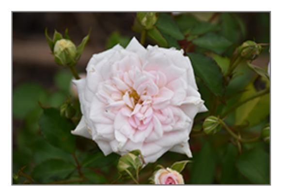
White Drift Rose flowers