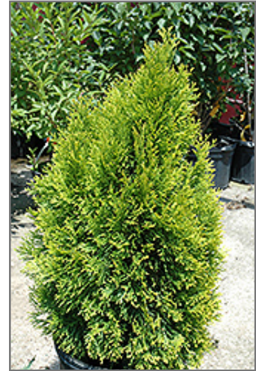
Highlights Arborvitae