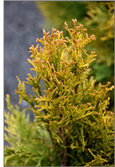
Highlights Arborvitae foliage

This tree does best in full sun to partial shade. It prefers to grow in average to moist conditions, and shouldn't be allowed to dry out. It is not particular as to soil type or pH. It is somewhat tolerant of urban pollution, and will benefit from being planted in a relatively sheltered location. Consider applying a thick mulch around the root zone in winter to protect it in exposed locations or colder microclimates. This is a selection of a native North American species.