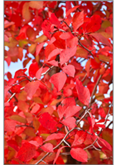
Wildfire Black Gum in fall

This tree does best in full sun to partial shade. It does best in average to evenly moist conditions, but will not tolerate standing water. It is very fussy about its soil conditions and must have rich, acidic soils to ensure success, and is subject to chlorosis (yellowing) of the foliage in alkaline soils. It is quite intolerant of urban pollution, therefore inner city or urban streetside plantings are best avoided, and will benefit from being planted in a relatively sheltered location. Consider applying a thick mulch around the root zone in winter to protect it in exposed locations or colder microclimates. This is a selection of a native North American species.