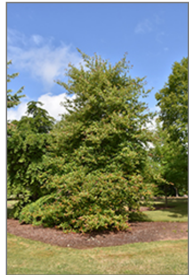
Wildfire Black Gum