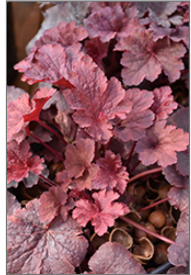
Cajun Fire Coral Bells foliage

Cajun Fire Coral Bells is recommended for the following landscape applications;