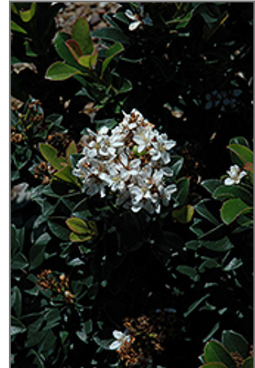
Snow White Indian Hawthorn flowers