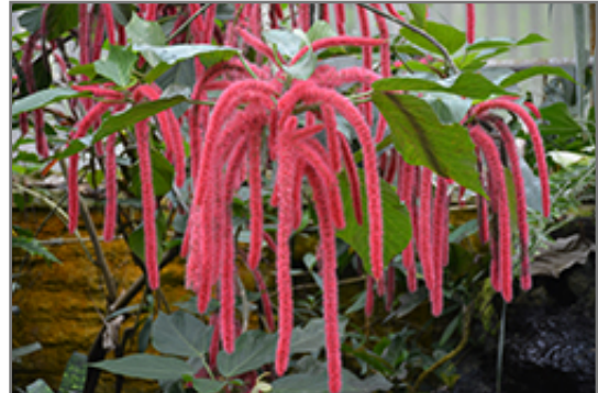
Firetail Chenille Plant flowers