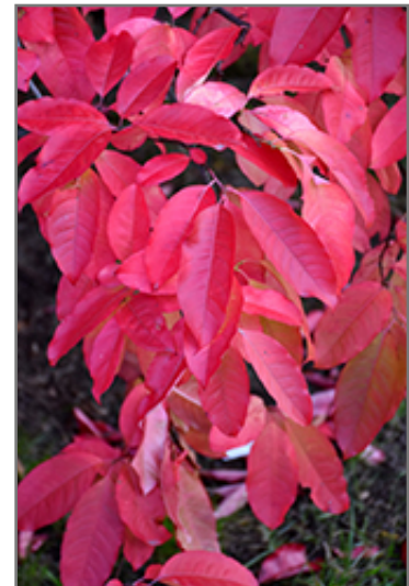
Sourwood in fall