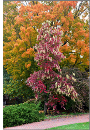
Sourwood in fall

This tree does best in full sun to partial shade. It does best in average to evenly moist conditions, but will not tolerate standing water. It is very fussy about its soil conditions and must have rich, acidic soils to ensure success, and is subject to chlorosis (yellowing) of the foliage in alkaline soils. It is quite intolerant of urban pollution, therefore inner city or urban streetside plantings are best avoided, and will benefit from being planted in a relatively sheltered location. Consider applying a thick mulch around the root zone in winter to protect it in exposed locations or colder microclimates. This species is native to parts of North America, and parts of it are known to be toxic to humans and animals, so care should be exercised in planting it around children and pets.