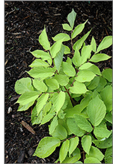
Sun King Japanese Spikenard foliage

This plant performs well in both full sun and full shade. It prefers to grow in average to moist conditions, and shouldn't be allowed to dry out. It is not particular as to soil type or pH. It is highly tolerant of urban pollution and will even thrive in inner city environments. This is a selected variety of a species not originally from North America.