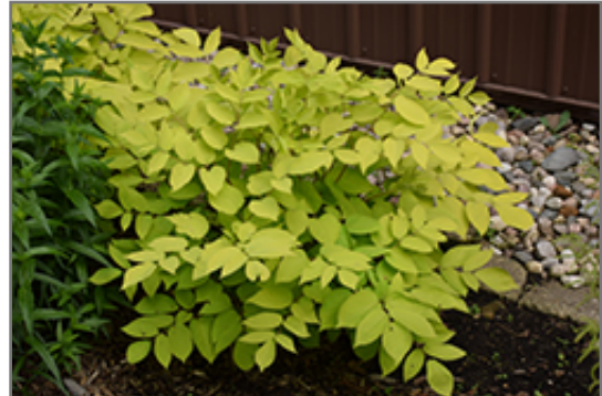
Sun King Japanese Spikenard