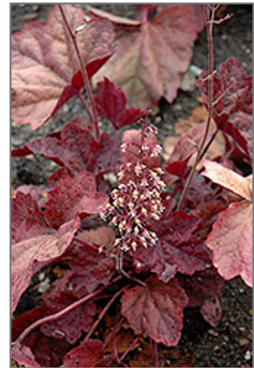
Lava Lamp Coral Bells flowers