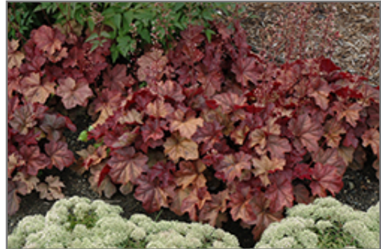
Lava Lamp Coral Bells

Lava Lamp Coral Bells is a fine choice for the garden, but it is also a good selection for planting in outdoor pots and containers. With its upright habit of growth, it is best suited for use as a 'thriller' in the 'spiller-thriller-filler' container combination; plant it near the center of the pot, surrounded by smaller plants and those that spill over the edges. Note that when growing plants in outdoor containers and baskets, they may require more frequent waterings than they would in the yard or garden.