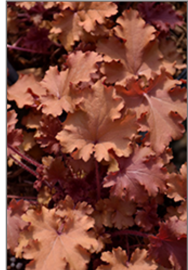
Peach Crisp Coral Bells foliage

Peach Crisp Coral Bells is a fine choice for the garden, but it is also a good selection for planting in outdoor pots and containers. With its upright habit of growth, it is best suited for use as a 'thriller' in the 'spiller-thriller-filler' container combination; plant it near the center of the pot, surrounded by smaller plants and those that spill over the edges. Note that when growing plants in outdoor containers and baskets, they may require more frequent waterings than they would in the yard or garden.