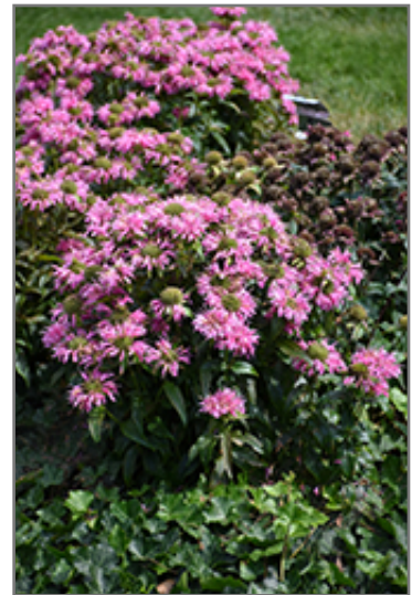
Pardon My Pink Beebalm in bloom Photo courtesy of NetPS Plant Finder